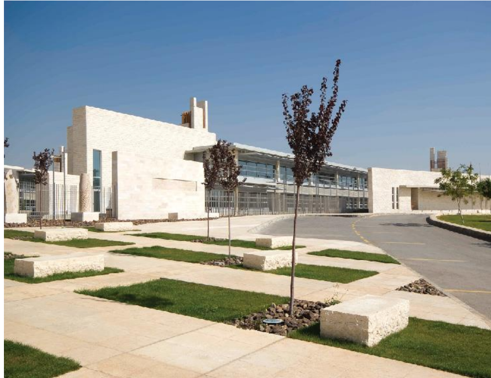
"The International Academy, Amman", www.conexjo.com , 2019, https://www.conexjo.com/portfolio/the-international-academy-amman/